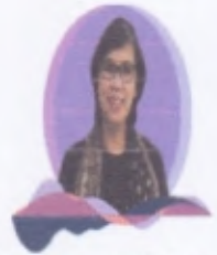
H.E. Lenny N. Rosalin Deputy Minister for Gender Equality, Ministry of Women's Empowerment and Child Protection in Indonesia Topic: "Promoting Gender Equality in STEM for Sustainable Development"